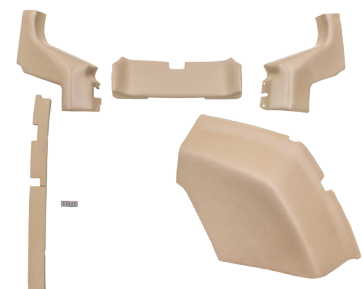
JD 6000 Series Kit - Late (ASN 146608) PN: 4607

See REVERSE for applications and features.