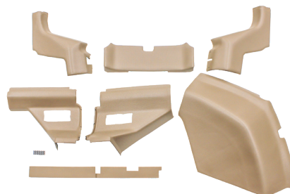
JD 6000 Series Kit - Mid (S/N 131952-146608) PN: 4606