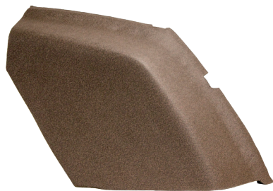
JD 6000-6010 Series Fender Panel - LH (Multi-Brown Vinyl) PN: 4242