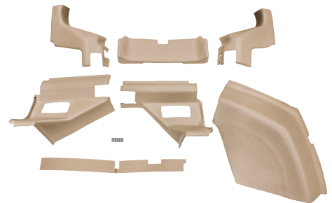
JD 6000 Series Kit - Early (BSN 131952) PN: 4605