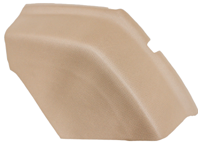
JD 6000-6010 Series Fender Panel - LH (Tan Vinyl) PN: 4284