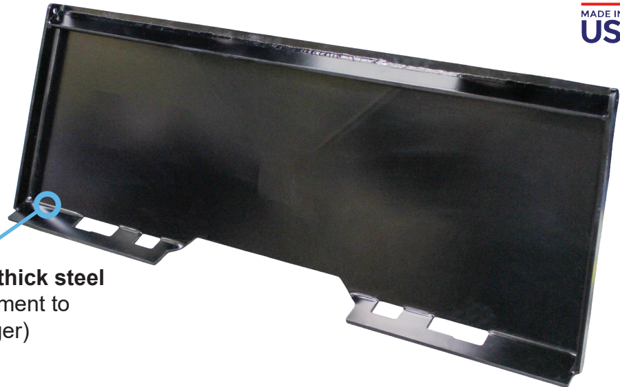
Plate constructed of 5/16" thick steel for better structural reinforcement to prevent bending (25% stronger)