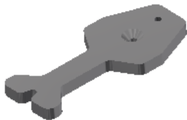
JD 5000 Series PED 10809

Installation instructions to place a K&M 117 Uni Pro into a John Deere 5000 Series open station tractor