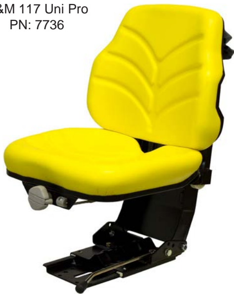
K&M 117 Uni Pro PN: 7736