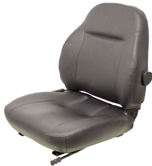
441 Uni Pro Black Vinyl PN: 8021