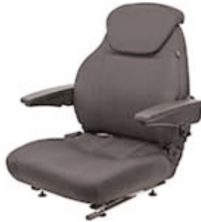
440 Uni Pro Black Fabric PN: 8014