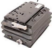
KM MSG83 Mechanical Suspension PN: 8079

Note! Weight needs to be applied to the suspension to turn the mechanical knobs.