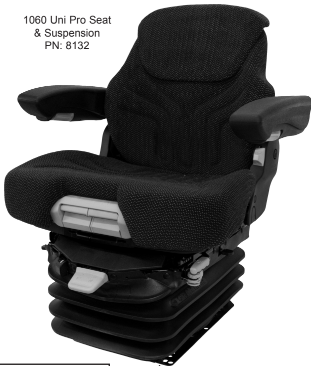
1060 Uni Pro Seat & Suspension PN: 8132

Weight needs to be applied to the suspension to activate the pump.