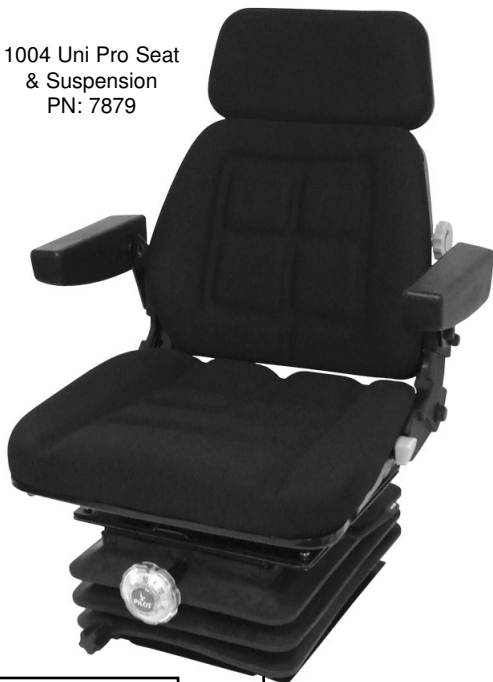
1004 Uni Pro Seat & Suspension PN: 7879

Weight needs to be applied to the suspension to turn the mechanical knobs.