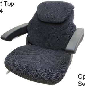
731 Seat Top PN: 8374