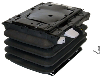
Optional Swivel Kit Available PN: 5007