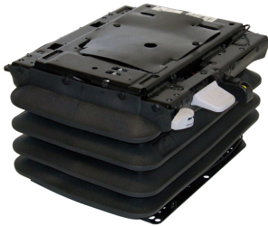
MSG95 Suspension PN: 8078