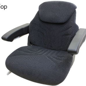
Optional Swivel Kit Available PN: 5007