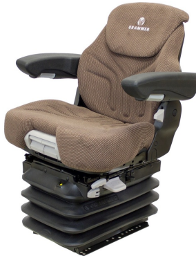
KM 1310 Uni Pro Seat & Suspension PN: 8276