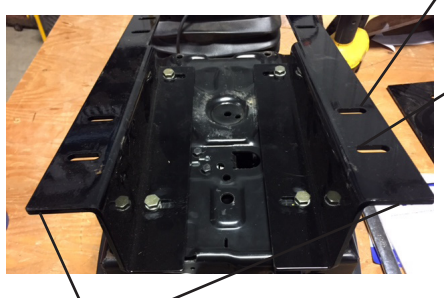
Backets 10682 & 10683