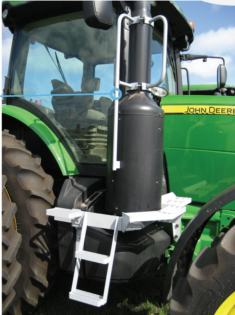
*PN: 3433 shown in white for clarity.