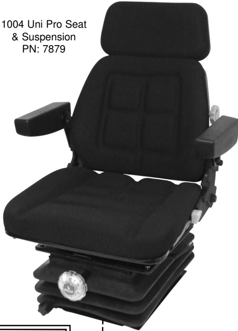
1004 Uni Pro Seat & Suspension PN: 7879