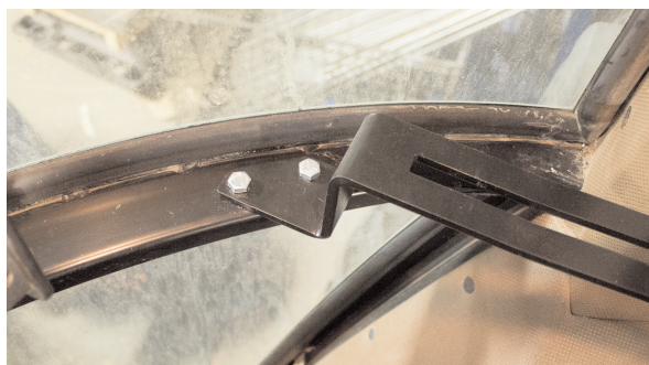
Front mounting of monitor bracket.