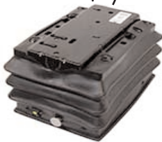
KM MSG93 Air Suspension PN: 8080