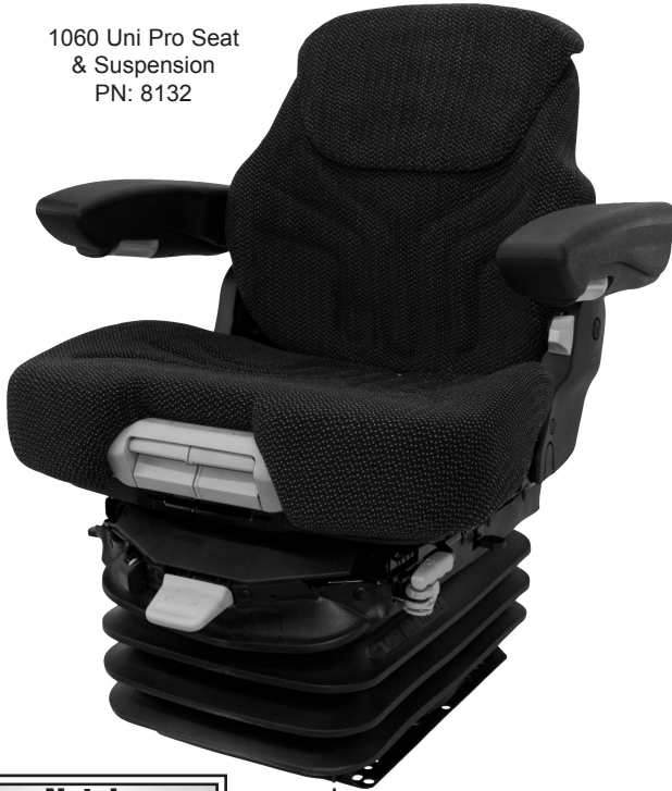
1060 Uni Pro Seat & Suspension PN: 8132