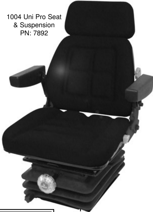
1004 Uni Pro Seat & Suspension PN: 7892