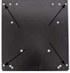
Use indicated holes to mount assembly to tractor.